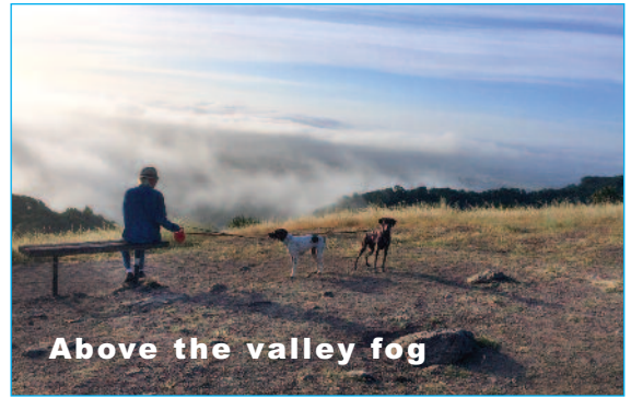
Above the valley fog